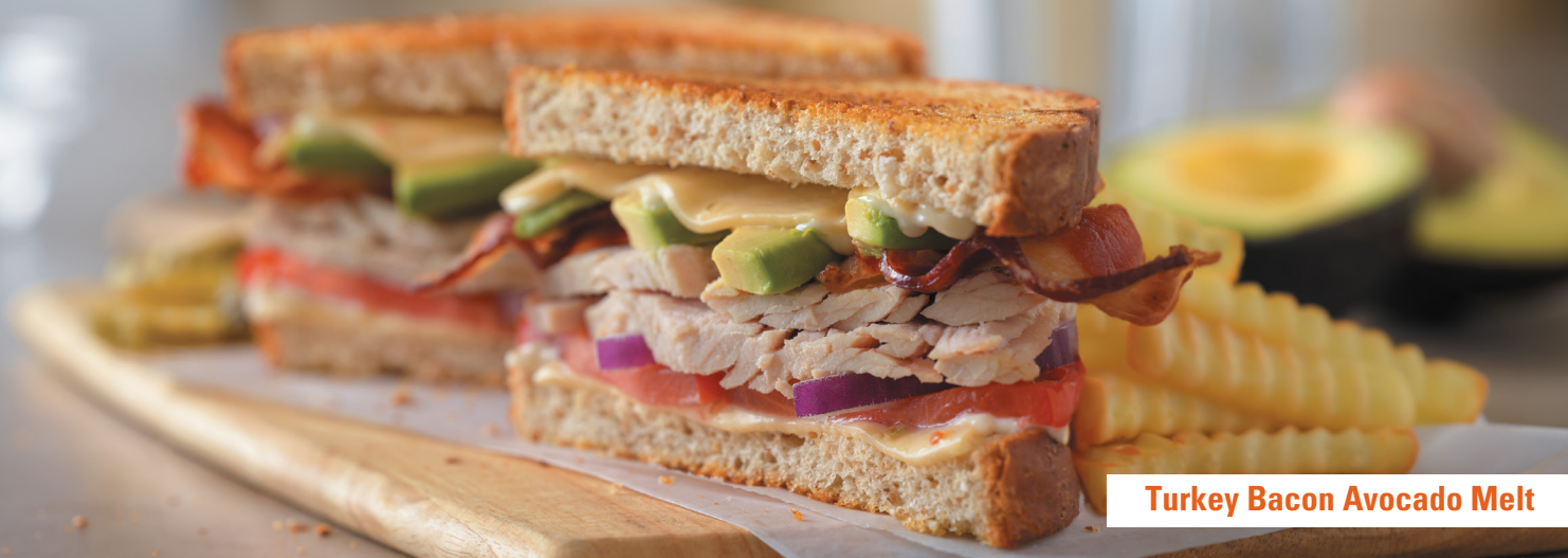
Turkey Bacon Avocado Melt