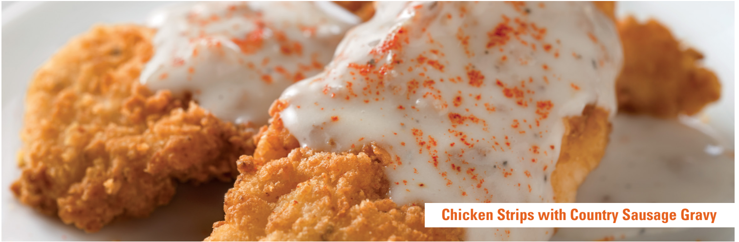
Chicken Strips with Country Sausage Gravy