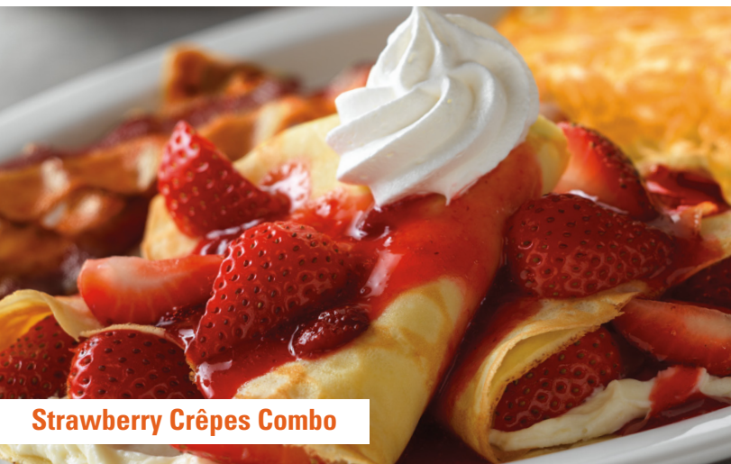
Strawberry Crêpes Combo

Sausage, egg and melted cheddar cheese stuffed crepes. Topped with a drizzle of maple syrup and sausage crumbles. Served with hash browns and choice of two bacon strips or two sausage links. $14.99 Just a crêpe (1) (520 cal) $5.29