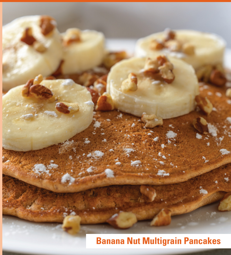
Banana Nut Multigrain Pancakes

Substitute a Supreme Item for only 2.79 Add an additional Supreme Item for only 2.79