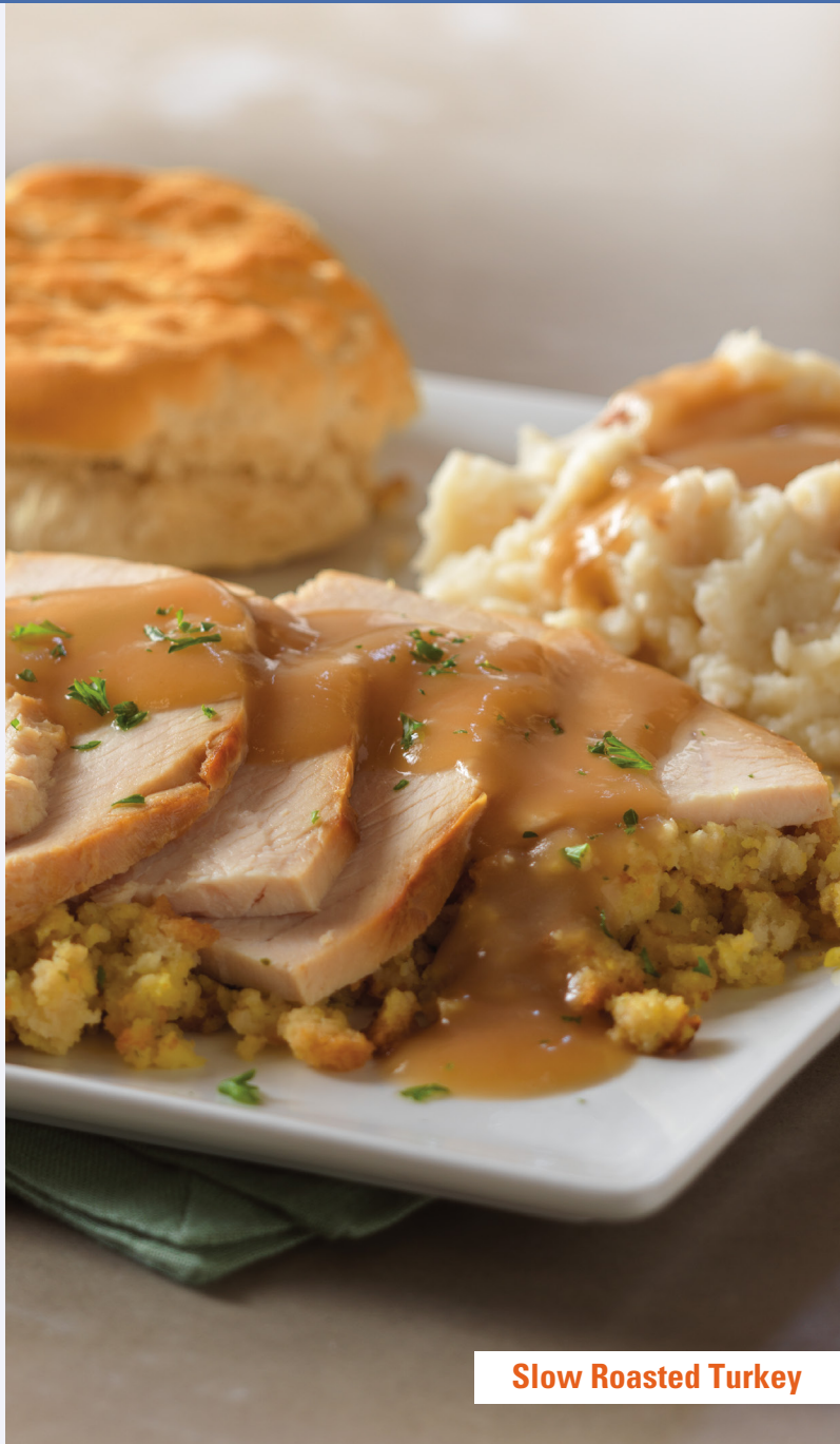
Slow Roasted Turkey

Roasted chicken breast with carrots, celery, peas, potatoes and onions in a creamy sauce, topped with a flaky pie crust. Served with a fresh side salad. (1300-1460 cal) 15.49