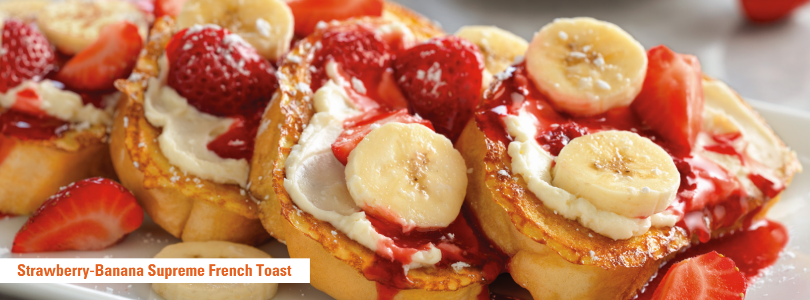
Strawberry-Banana Supreme French Toast