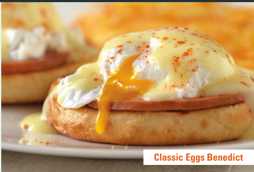
Classic Eggs Benedict

Two poached eggs over grilled tomatoes, onions, sliced mushrooms and fresh spinach atop a toasted English muffin with bacon and Swiss cheese. Topped with Tomato Basil Hollandaise and fresh avocado slices. Served with golden hash browns or grits. (720 cal) 16.49