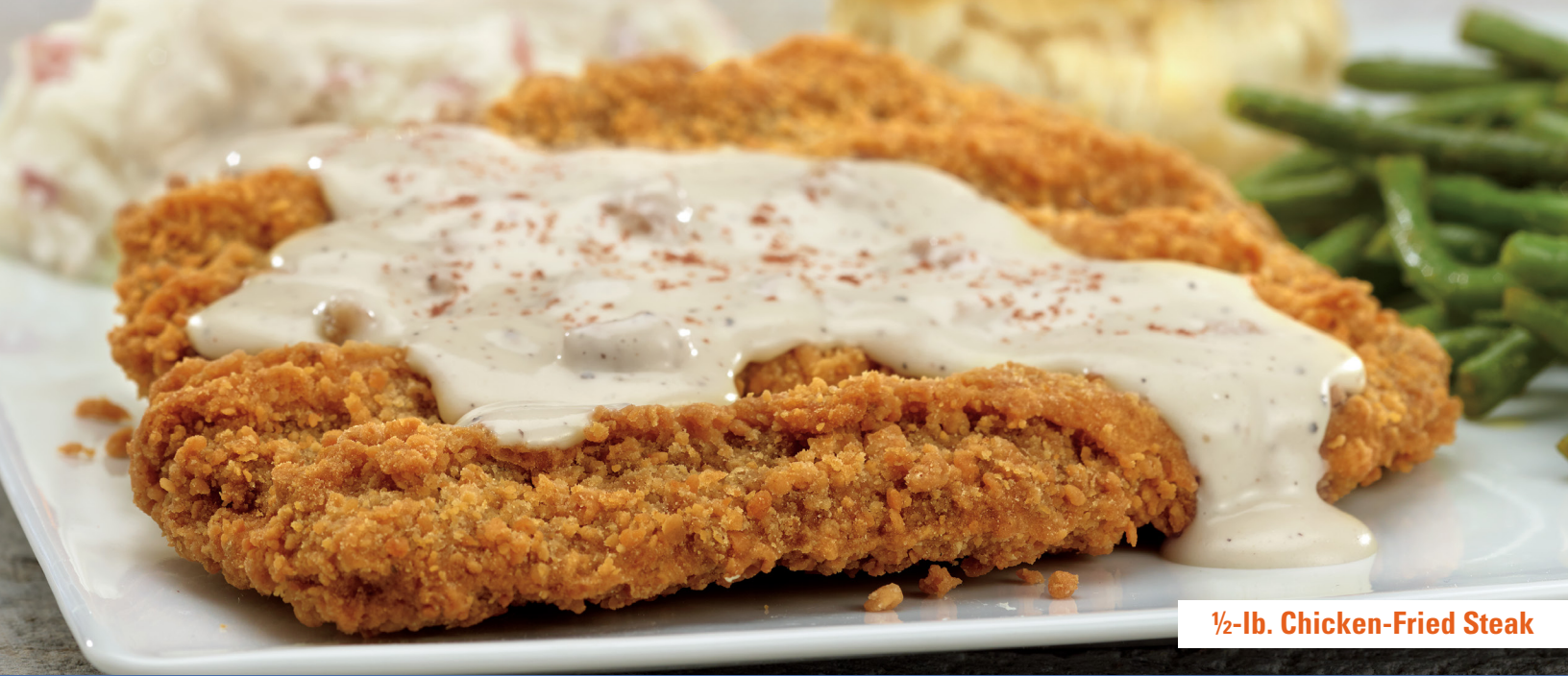
1/2-lb. Chicken-Fried Steak