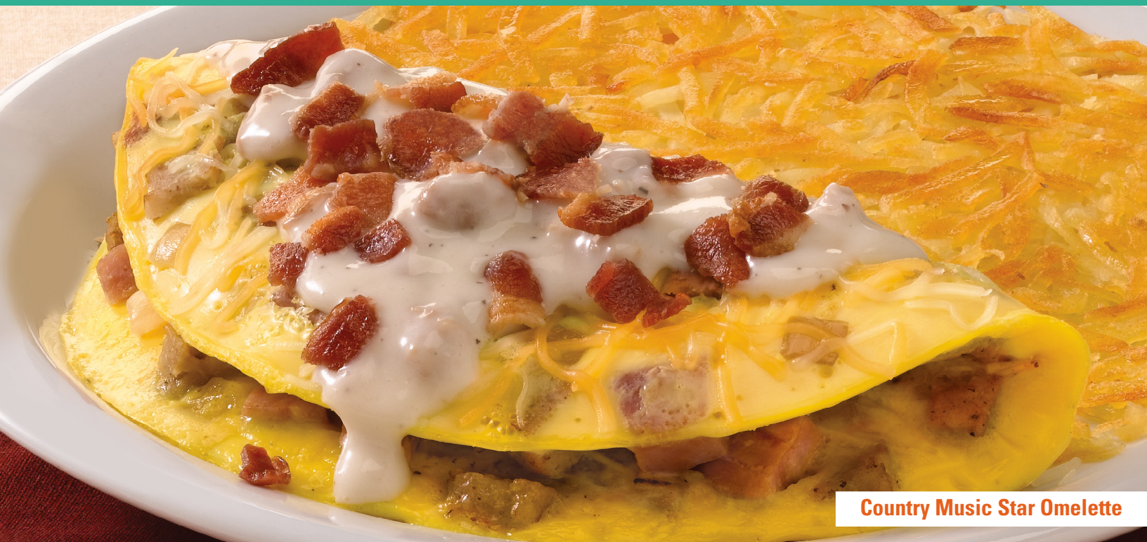
Country Music Star Omelette

2,000 calories a day is used for general nutrition advice, but calorie needs vary.