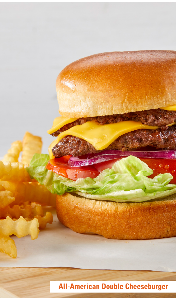
All-American Double Cheeseburger