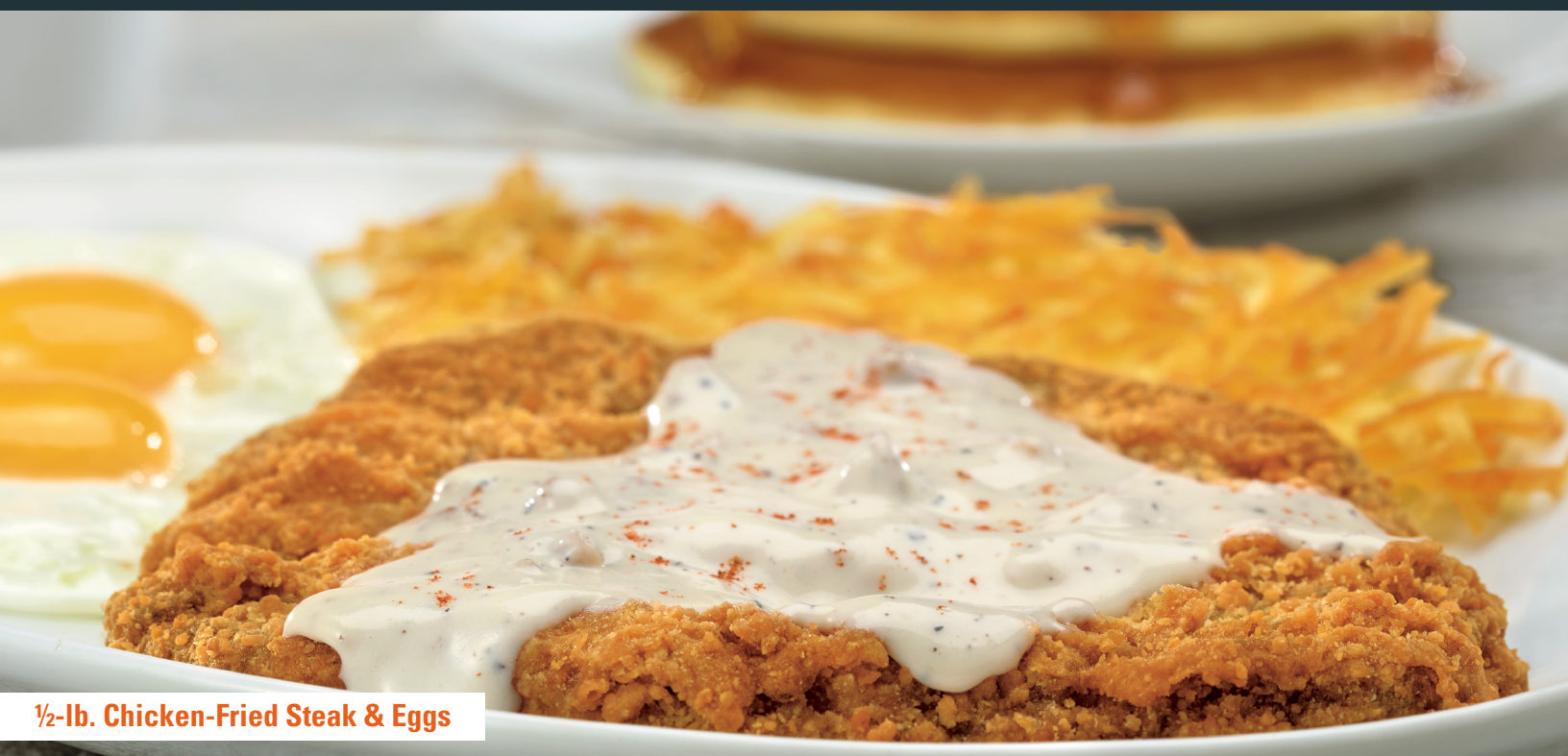
½-lb. Chicken-Fried Steak & Eggs

Two bone-in center cut pork chops and two fresh eggs, any style. Served with three fluffy, made-from-scratch buttermilk pancakes and hash browns or grits. (1590/1610 cal) 16.99