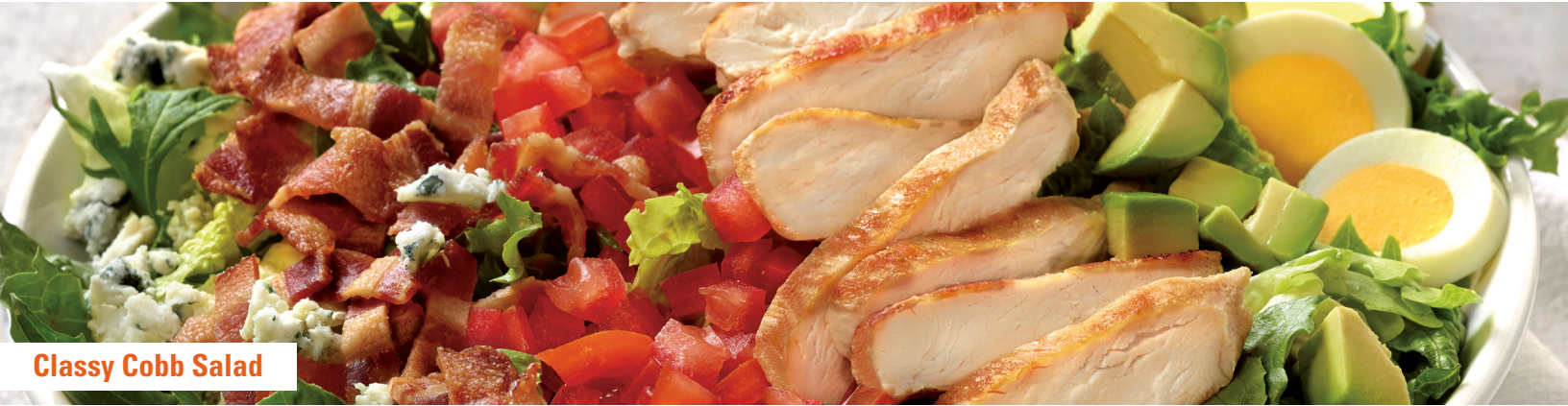
Classy Cobb Salad